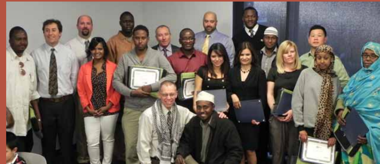
Westside Leadership Institute Spring 2013 Graduation.