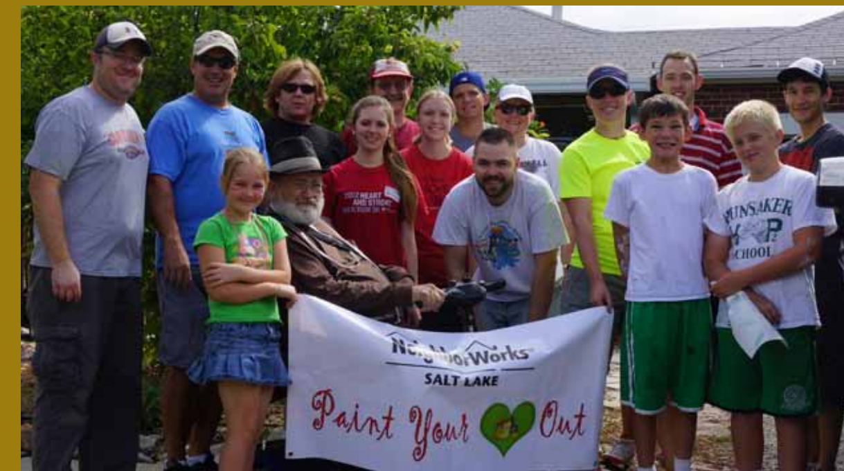
Federal Deposit Insurance Corporation (FDIC) Team Painted a Home for Senior Citizen During PYHO 2013.