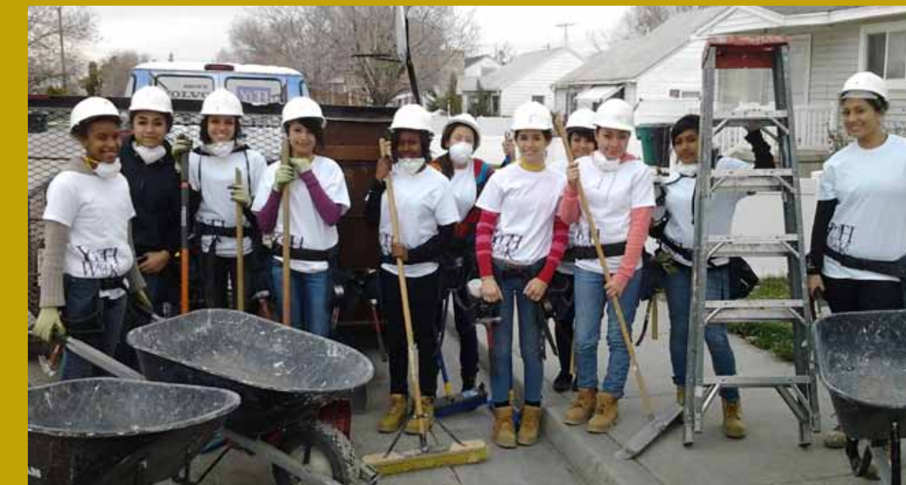
YouthWorks Spring 2013 Crew.